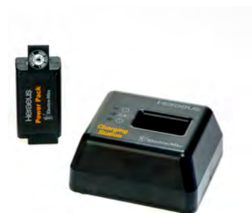
Battery and charging station