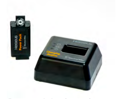
Battery and charging station